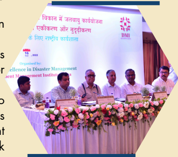
Pic : National workshop on Integrating & strengthening Climate Action in Urban Development, 16 Sep 2022

In realising the above vision, CoEDM would strive to provide end-to-end knowledge solutions for various stakeholders to effectively contribute to a 'Resilient Bihar' through strategic and systematic Disaster Risk Reduction (DRR) and Climate Change adaptation strategies and actions.