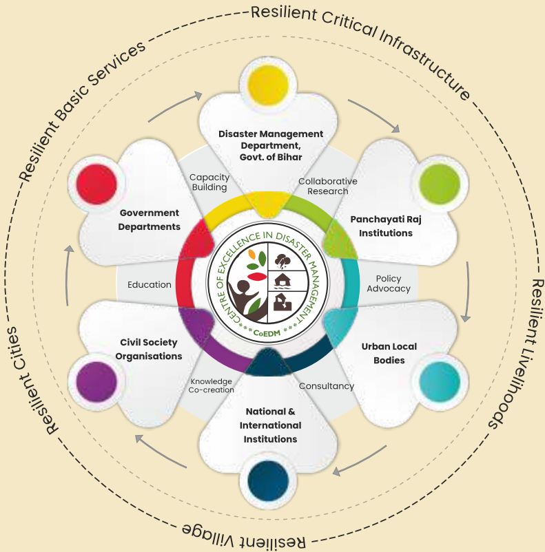
Fig.: Conceptual Framework of CoEDM

For achieving the goal of "Disaster Resilient Bihar, the DRR Roadmap 2015-30 highlights the dire need to strengthen the institutional framework and capacity enhancement in Bihar. Hence, a centre dedicated to the domain of disaster management has been set-up at the DM