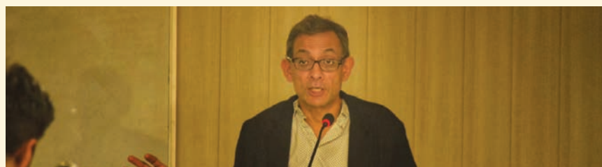
Special Session by Nobel laureate Prof. Abhijit Vinayak Banerjee from MIT, USA on - "The Science of Fighting Poverty: Learnings from J-PAL"