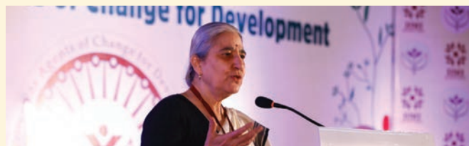
Padma Shri Renana Jhabvala during Fifth Foundation Day Symposium of DMI